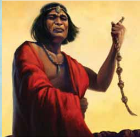
Po'Pay holding the knotted rope indicating the day of the revolution.

In the 1670s, the Spanish governor of New Mexico ordered several Pueblo holy men executed, and many others publicly whipped. Po'Pay, (Popé) a holy man and War Captain of Ohkay Owingeh, was one of the men whipped in Santa Fe, an experience that hardened his resolve to drive the Spanish from New Mexico. In