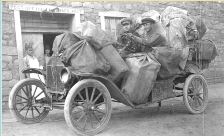
This mail car took 2 days to carry the load of mail from Ganado, AZ to Gallup, NM