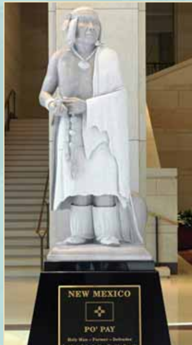
Statue of Po'Pay in the U.S. Capitol Statuary, Washington, DC

the face of turmoil, suffering from prolonged drought, and fearing the complete loss of their culture, the Pueblo people resorted to armed resistance.